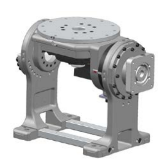
Support for all major motors 2 axis positioner gearhead RVP-A Series

Simple assembly, easy production BBQ Positioner Kit