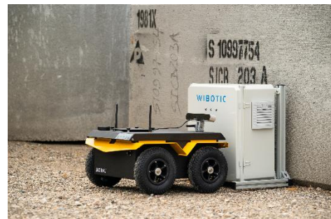
Ex. utilization in AGV charging